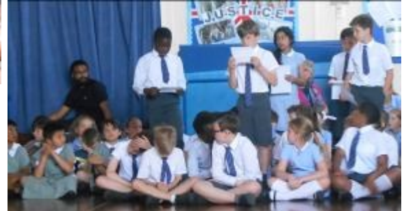
Willow class reflected on events and activities from the past in which they had had to persevere.